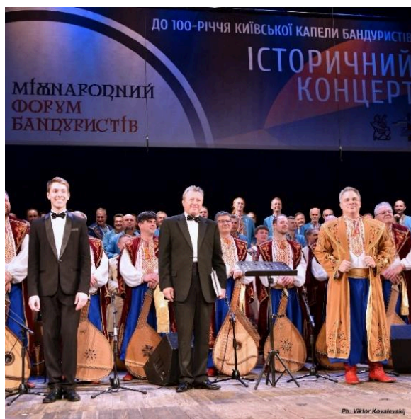
Joint centennial performance of the Ukrainian Bandurist Chorus of North America with the National Bandurist Capella of Ukraine . (Ivan Franko Theater – Kyiv, Ukraine. October 2018)

In 2018, the Ukrainian Bandurist Chorus celebrated its 100 th anniversary with concert tours of the United States, Canada, and Ukraine. Through sound and visuals, the performances highlighted the turbulent and triumphant history of the ensemble, from its roots in early 20 th century Ukraine, through the crucible of Soviet and Nazi occupation, immigration to North America, and to the continuing mission of the ensemble in the 21 st century. The historic tour of Ukraine included