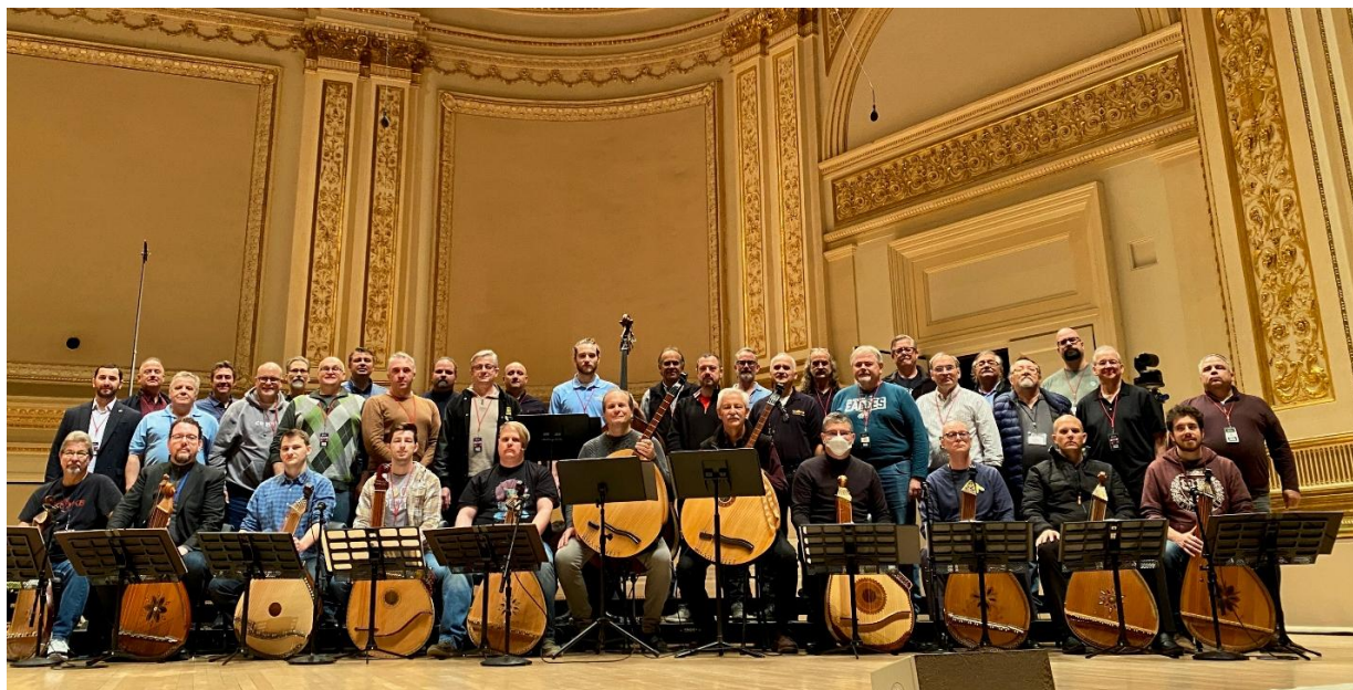
The “Notes from Ukraine” Centennial Concert of Shchedryk (Carol of the Bells) at Carnegie Hall. The UBC on stage before the historic performance. (December, 2022).