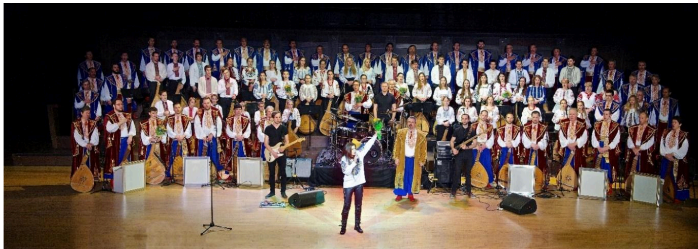
Eurovision winner Ruslana and the Ukrainian Bandurist Chorus of North America (Massey Hall – 2015)

(Toronto), the Hoosli Ukrainian Male Chorus (Winnipeg), the Women’s Bandura Ensemble of North America, the Shchedryk Children’s Choir (Kyiv), violinist Vasyl Popadiuk, the Shumka Dance Ensemble (Edmonton), the National Bandurist Capella of Ukraine (Kyiv), and various bandura schools and Ukrainian youth choirs throughout the continent.