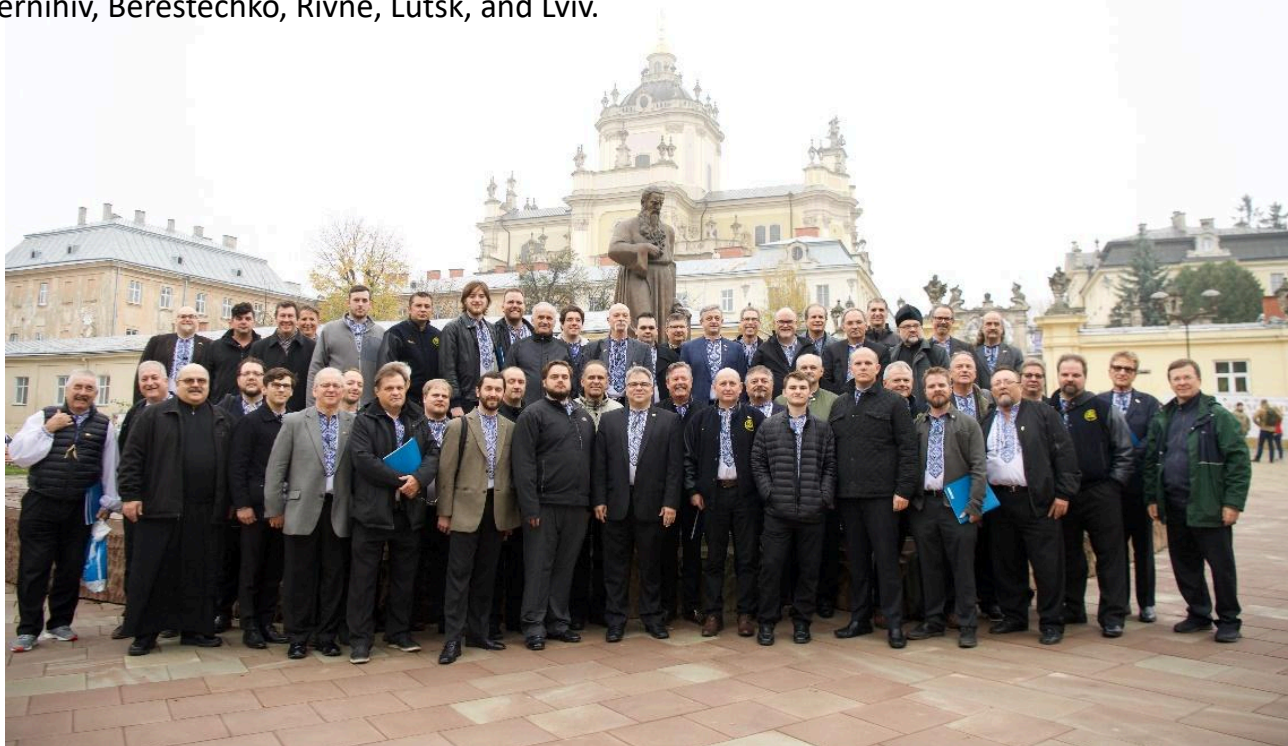
The UBC sang the liturgical responses at St. George Ukrainian Catholic Cathedral (Lviv, Ukraine – October, 2018).

Divine Liturgies in Kyiv and Lviv, outreach programs at various institutions, and concerts in Kyiv, Chernihiv, Berestechko, Rivne, Lutsk, and Lviv.