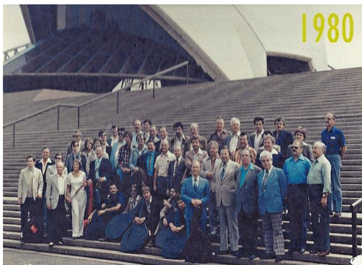
Sydney, Australia (1980)

Notwithstanding these difficulties in a new land, the Ukrainian Bandurist Chorus took part in concert tours throughout North America. In 1958 the Chorus embarked on a triumphant concert tour of Western Europe. The ensemble performed in England, France, Germany, Switzerland, Spain, Belgium and the Netherlands, all while garnering critical acclaim in leading newspapers.